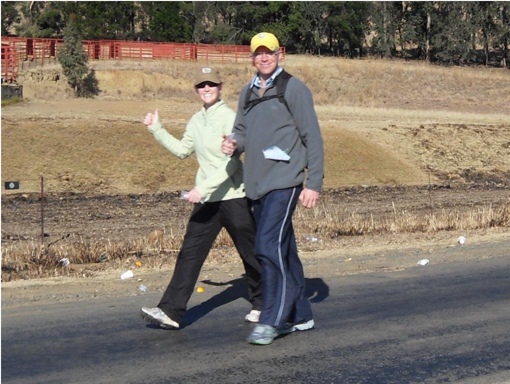
Top of Botha's Pass, we are nearly there.